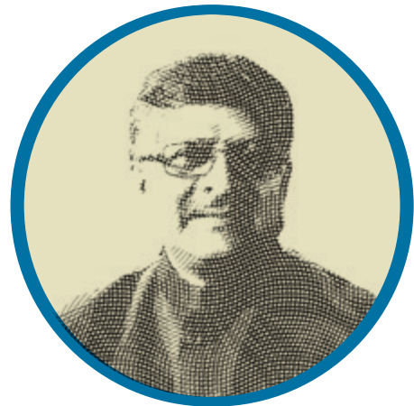
Ravi Shankar Prasad

Minster of Law and Justice and Information Technology